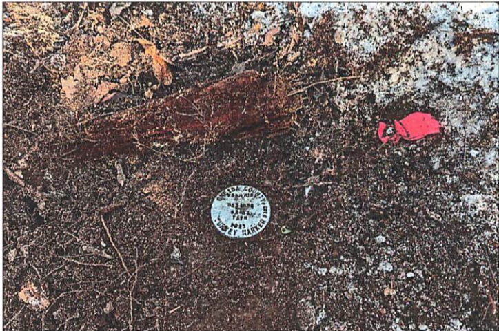
rotted wood post point & new monument