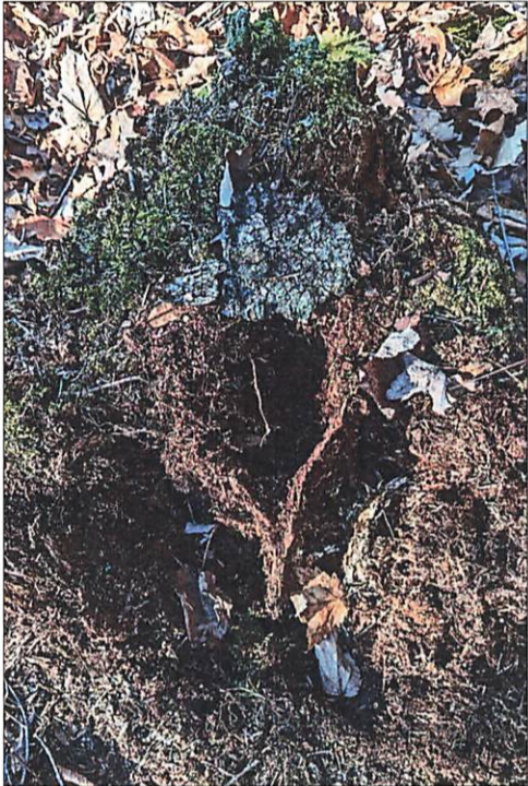
birch tree stump