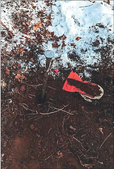
new monument in found hole