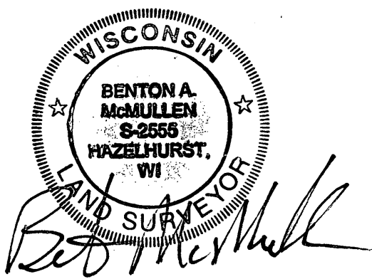
PROFESSIONAL LAND SURVEYOR # S-2555

This survey was performed under the order of: LINDA OWEN